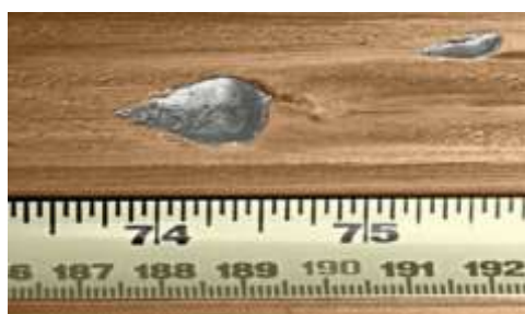
Figure 2 : Typical gouge on copper rail [McNab et al., 2011]

Under certain circumstances, which are expected to be clarified during the internship, some asperities and particles of different sizes stick together with the rails surface. During subsequent shots, the armature thus impacts micro-obstacles of various sizes resulting in formation of gouging (typical tear-drop shaped, see Fig.2).